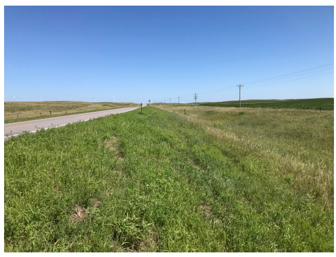
Results 10 Months After Installation of ProGanics and Erosion Control Solutions