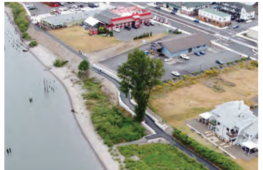
After River Walk Installation w/ Presto Geoweb Support