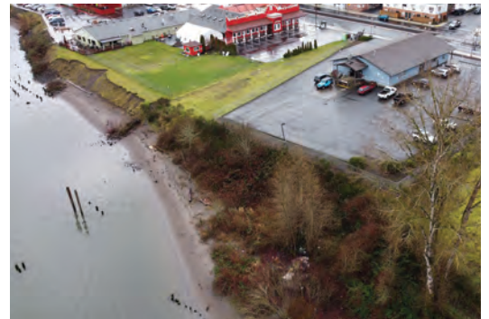
Before River Walk Installation w/ Massive Erosion

The Geoweb Soil Stabilization System prevents erosion by confining the infill material within its cellular structure (geocells), making it resistant to sheet flow and preventing scour on slope surfaces. The Geoweb system promotes vegetation growth, making it a long-term replacement for other expensive erosion solutions.