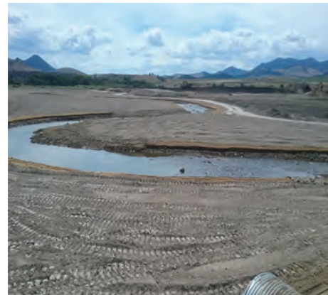
Before Biosol Forte

What's unique about Biosol? You have never seen a fertilizer like this for longevity and improving soil health! Watch our Biosol Technical Talks Webinar to learn more about this product.