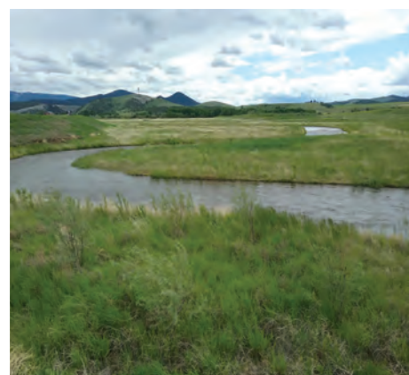
2 Years After Biosol Forte