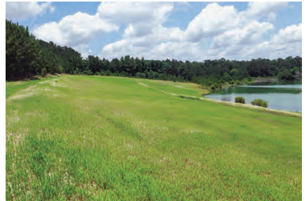
4 Months After Application