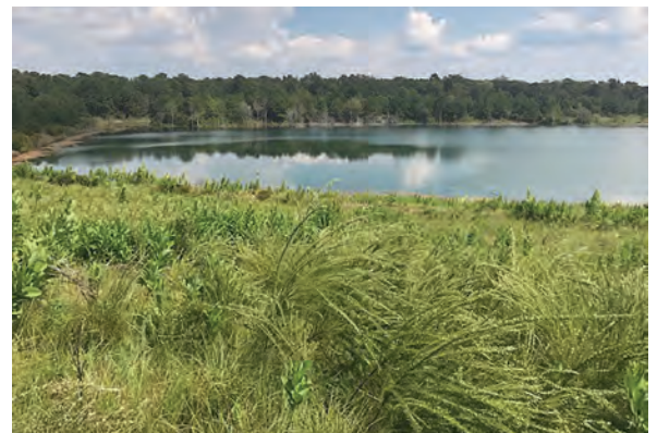
1 Year After Application