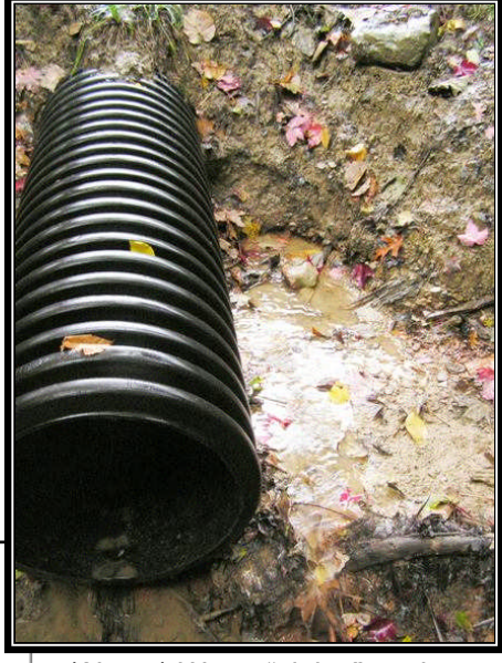
(Above) Water "piping" on the <u>outside</u> of a corrugated pipe following the annular space in the trench (preventable with an anti-seep plug of AquaBlok)

Distributed by: ASP Enterprises: Phone: 800-869-9600, www.aspent.com