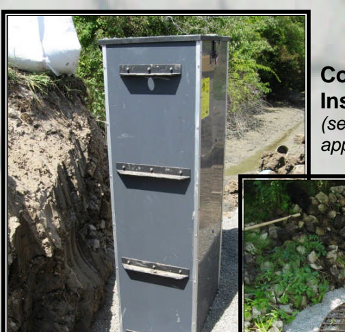
Control Structure Installations & Repairs ~ (see reverse for related anti-seep applications)

compaction is necessary (reducing labor and installation costs). Because the product both swells and self-compacts, AquaBlok will naturally "key" into the soil around it – providing a tight seal.