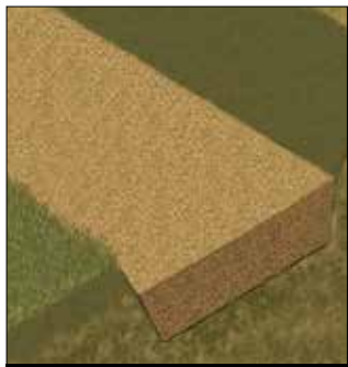
1. Prepare Base Leveling Pad

After selecting the location and length of the wall, excavate the base trench to the designed width and depth. Remove all surface vegetation and debris. Do not use this material as backfill. Start the leveling pad at the lowest elevation along wall alignment. Prepare the leveling pad base with 16 inches (400mm) of well-compacted granular fill (gravel, road base, or 1/2-inch to 3/4-inch (10 - 20mm) crushed stone). At required elevation changes in the leveling pad, step up in 8-inch (200mm) increments. Compact to 95% Standard Proctor or greater. Do not use PEA GRAVEL or SAND for leveling pad.