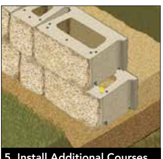
5. Install Additional Courses

Once the pins have been installed, provide ½" to ¾" (10-20mm) crushed stone drainage fill behind the units to a minimum distance behind the tail of 1' (300mm). Fill all open spaces between units and open cavities/cores with the same drainage material. Proceed to place backfill soil in maximum 8" (200mm) layers and compact to 95% Standard Proctor with the appropriate compaction equipment.