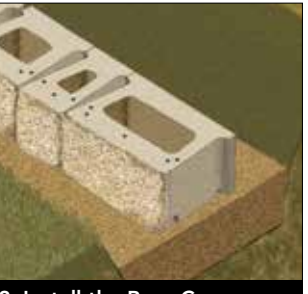
2. Install the Base Course

After selecting the location and length of the wall, excavate the base trench to the designed width and depth. Remove all surface vegetation and debris. Do not use this material as backfill. Start the leveling pad at the lowest elevation along wall alignment. Prepare the leveling pad base with 16 inches (400mm) of well-compacted granular fill (gravel, road base, or 1/2-inch to 3/4-inch (10 - 20mm) crushed stone). At required elevation changes in the leveling pad, step up in 8-inch (200mm) increments. Compact to 95% Standard Proctor or greater. Do not use PEA GRAVEL or SAND for leveling pad.