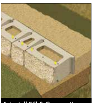
4. Install Fill & Compaction

NOTE: The large unit has an "optional" pin hole to ensure small units above do not slip between pins.