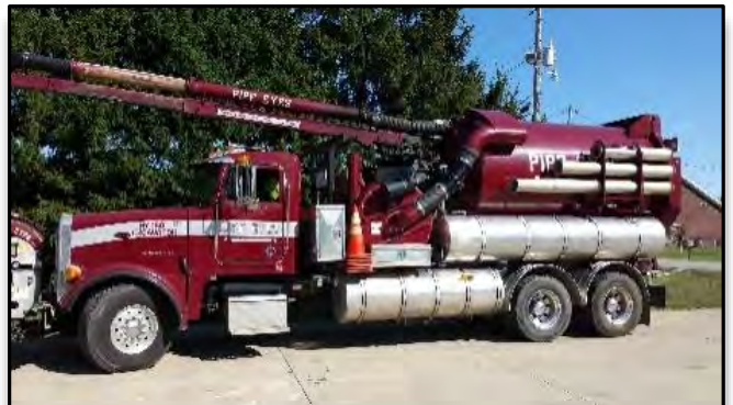
Combination Sewer Truck with 1,500 gallon water tank