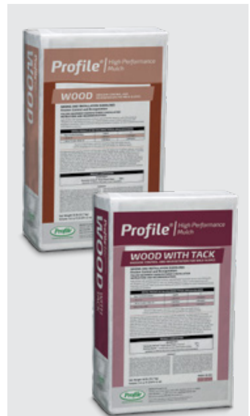
Made in Conover, North Carolina, USA