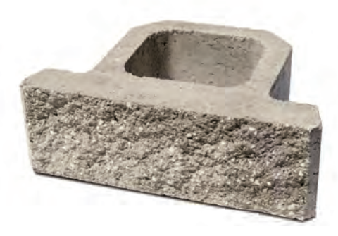
Appearance Dependability Efficiency

Premier 6 is one of the most innovative SRW products the industry has seen in its 30 year history. Its unique and patented .75 sq. ft. block design is changing the industry. Premier's 44 lb. unit weight reduces installer fatigue and beats all other block systems for strength, performance, freight efficiencies and ease of construction.