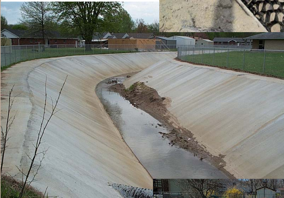
Chaffee Ditch Project Chaffee, MO During & After Construction