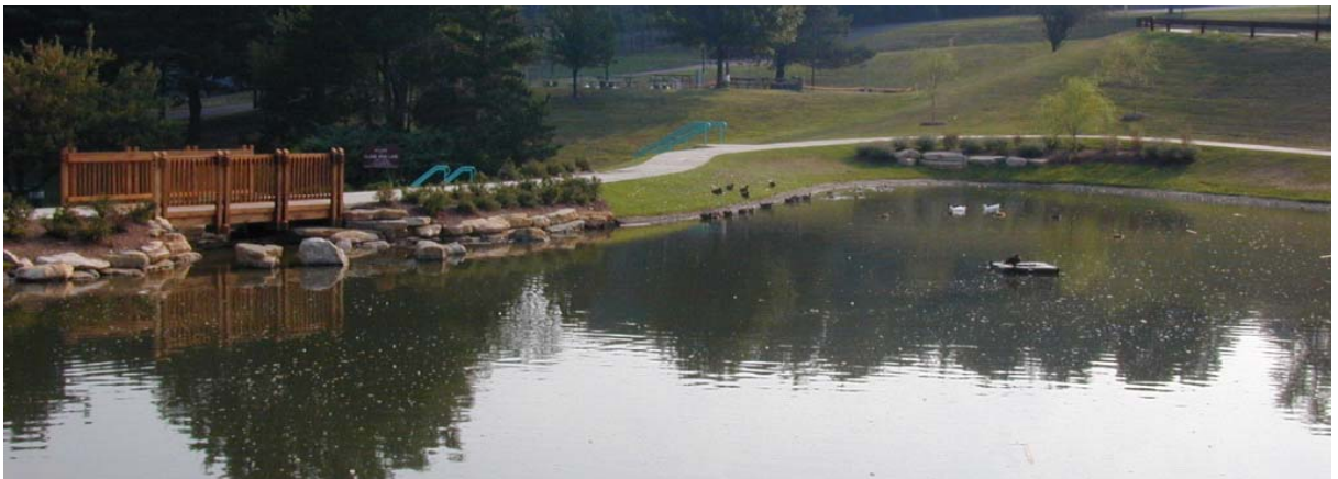
Ulasis Park - City of Ballwin, MO