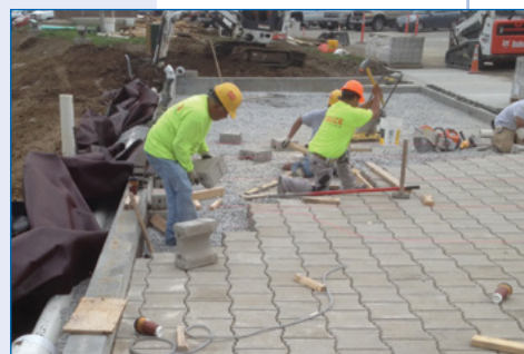
3 Hand placing block.