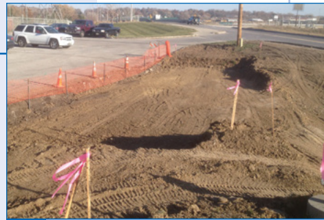
1 Excavated area.

Nina Cudahy with the City of Omaha said they were happy with the overall project but ended up with mixed results regarding the water monitoring. Part of the water bypasses the monitors making accurate tracking results difficult. She also mentioned the need on future projects to keep the treatment systems such as PaveDrain and the rain garden protected from post construction runoff debris.