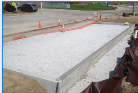
2 Walls, gravel base & RS380i.