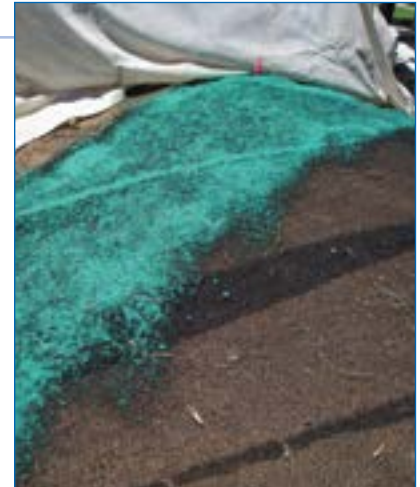
5 An intimate bond with the Enkamat and underlying soils.