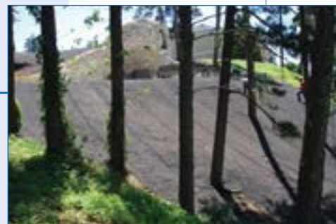
3 Steep and highly erodible Loess soils.

The result is a quickly established vegetated hillside that provides immediate stabilization as well as a long term solution to the highly erodible native soils found on these steep slopes along the Missouri River.