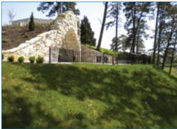
6 Approximately 21 days later, more than 90% vegetated.