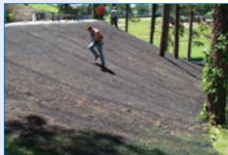
2 Steep (1:1) slopes and many mature pine trees.

The Profile Products GreenArmor System was chosen due to its ability to conform to the existing terrain and the openness of the Enkamat 7010 nylon root reinforcement matrix. This openness allows the Enkamat to be hydraulically infilled with the Flexterra FGM and together they provide an unparalleled bond to the underlying soils. A combination of 2 tried and true products that together provide a geosynthetic reinforced slope that is as resistant to erosion during its establishment as it is when it is fully vegetated.