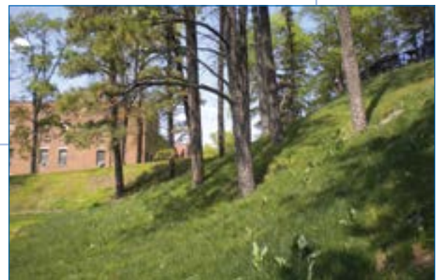
7 1 month after installation and ready to mow!