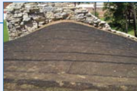
1 Undulating terrain required a very flexible TRM.

Very steep (1:1) slopes with a highly erodible Loess soil and numerous existing large Pine trees with restricted equipment access to the area to be vegetated. They needed it green in a hurry to meet the dedication deadline.