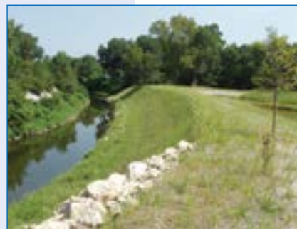
2 Partially vegetated.

This was achieved by building a reinforced slope as a bank of the creek that would not have been stable without the use of geosynthetic reinforcement and a Turf Reinforcement Mat. The contractor removed the existing soil and created a stable platform to build on. Once that was completed they brought the existing soil back in, as well as other fill material, in 18" lifts with alternating layers of Tensar BX Type 1 and UX 1400 HS. Once the slope was built and stable the contractor protected it with North American Green's C-350 TRM to assist the vegetation. There is a small section where the overflow of the detention basin outlets onto the slope that was protected with North American Greens P-550.