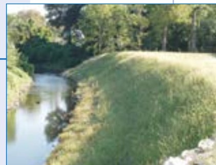
3 Fully vegetated.

The finished product is a beautiful slope with vegetation growing on it that is protected from rising water of Coldwater Creek and meeting all the detention requirements of the apartment complex.