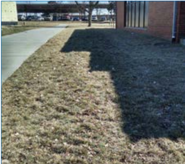
7 One year later the area has 90% growth and has had successful fire truck loading from training exercises.