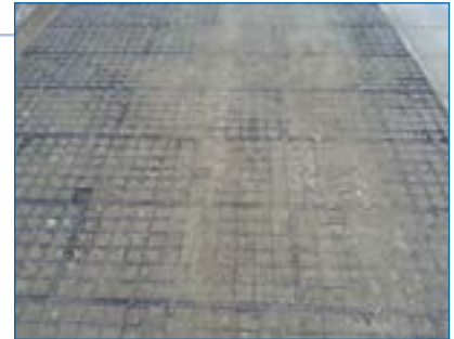
5 Topsoil is added to the open cells and brushed so the top of the cells are not covered by soil. This will allow the cell walls to protect the vegetation from the weight of the fire truck.