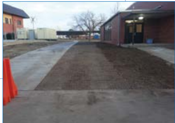
6 The area was seeded early spring 2014. Blueville Nursery also chose to cover the new seed with hydromulch knowing that the area was not irrigated.