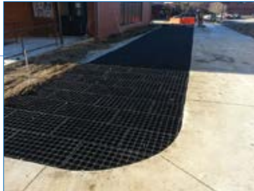
4 Geoblock is easily cut with a reciprocating saw for curved edges.