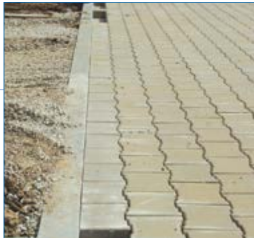
4 Blocks were cut to fill in gap at the curb.