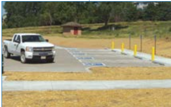
6 Parking lines painted and project seeded.