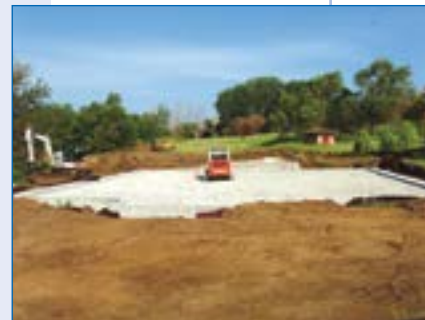
2 Geotextile and aggregate bedding installed.