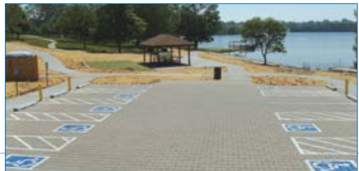
7 3,600 SF PaveDrain complete.