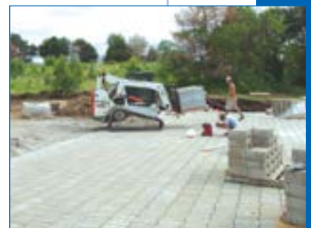
3 PaveDrain can be driven on immediately.