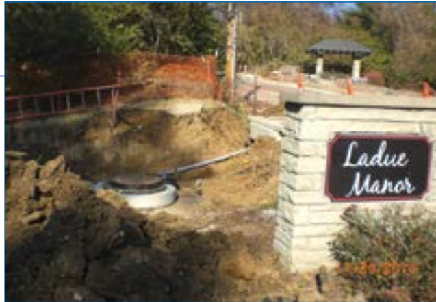
4 Offline design to increase sediment and debris capture.