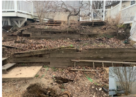
Before & After Transformation Pictures

Check out the pictures from some of our recent projects!