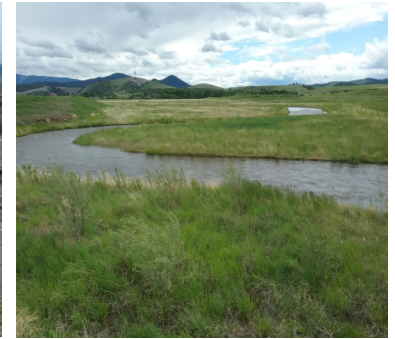
2 Years After Biosol Forte