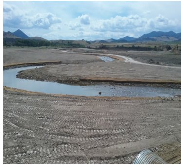
Before Biosol Forte

Biosol is a high-performance organic fertilizer. It is a long-lasting solution composed of 95-97% organically bound nitrogen and a 50% protein content. Biosol's quality organic composition not only stimulates micro-organism activity but also is proven to have a positive effect on plant health. Biosol can be applied using both standard methods and hydroseeding. Plus, it is safe to use around water bodies such as lakes and streams due to its organically bound stable nutrients from the fermentation process and low concentrations of nitrates and phosphorus. Contact Tom Bowman at 303-884-2733 with questions about Biosol.