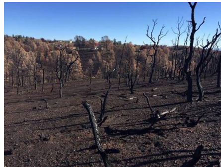
Post Fire Landscape