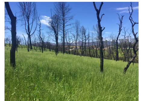
Vegetation Growth 4 Months After Seeding & Biosol Forte Application