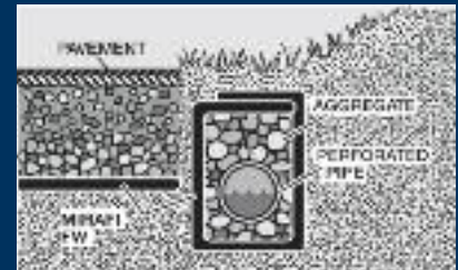
Cut-off/Interceptor Drain Along a Roadway

TenCate Geosynthetics Americas assumes no liability for the accuracy or completeness of this information or for the ultimate use by the purchaser. TenCate Geosynthetics Americas disclaims any and all express, implied, or statutory standards, warranties or guarantees, including without limitation any implied warranty as to merchantability or fitness for a particular purpose or arising from a course of dealing or usage of trade as to any equipment, materials, or information furnished herewith. This document should not be construed as engineering advice.