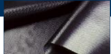
Mirafi® FW Woven Geotextile

BANK STABILIZATION / ROCK (ARMOR) UNDERLAYMENT Geotextile Placement Place the geotextile in close contact with the soil, eliminating folds or excessive wrinkles