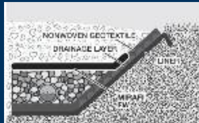
Leachate Collection System