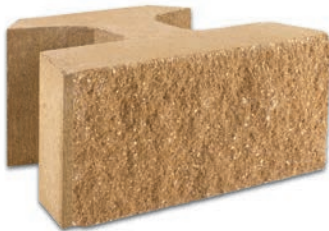
Straight Split Size: 8" H x 18" W x 12" D Weight: 80 lbs.

Unit specifications, availability, color, and fascia options vary by manufacturer. Please contact your nearest Rockwood manufacturer or dealer for more information.