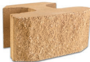
Beveled Split Size: 8" H x 18" W x 12" D Weight: 80 lbs.

ROCKWOOD ® RETAINING WALLS A better way. ™